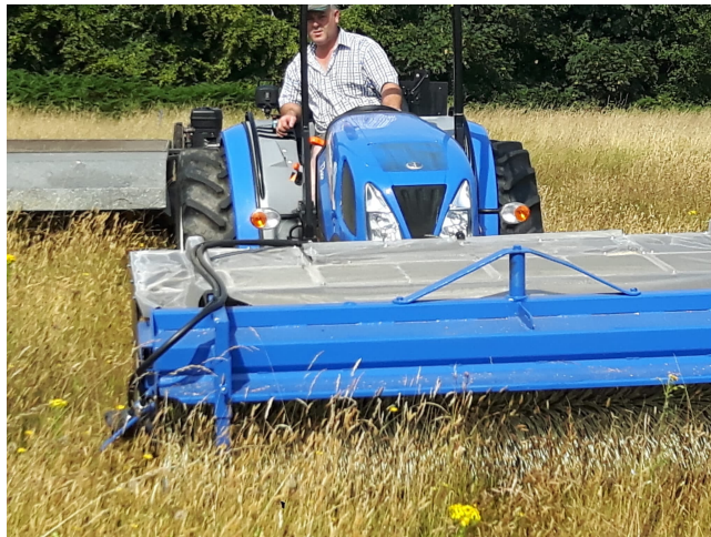
Brush Harvester - can collect from a range of habitats (e.g. meadows, heathlands, wetlands etc)

We collect seed by brush harvesting – EcoSeeds pioneered this methodology in Ireland in 2000 – This uses a gently rotating brush that leaves the donor plant intact. This method causes minimal disturbance to the existing habitat and allows the area to still be cut for hay. Typically we use GPS to measure and harvest a maximum of 80% of an area for no more than three consecutive years – based on ENSPA code of conduct .